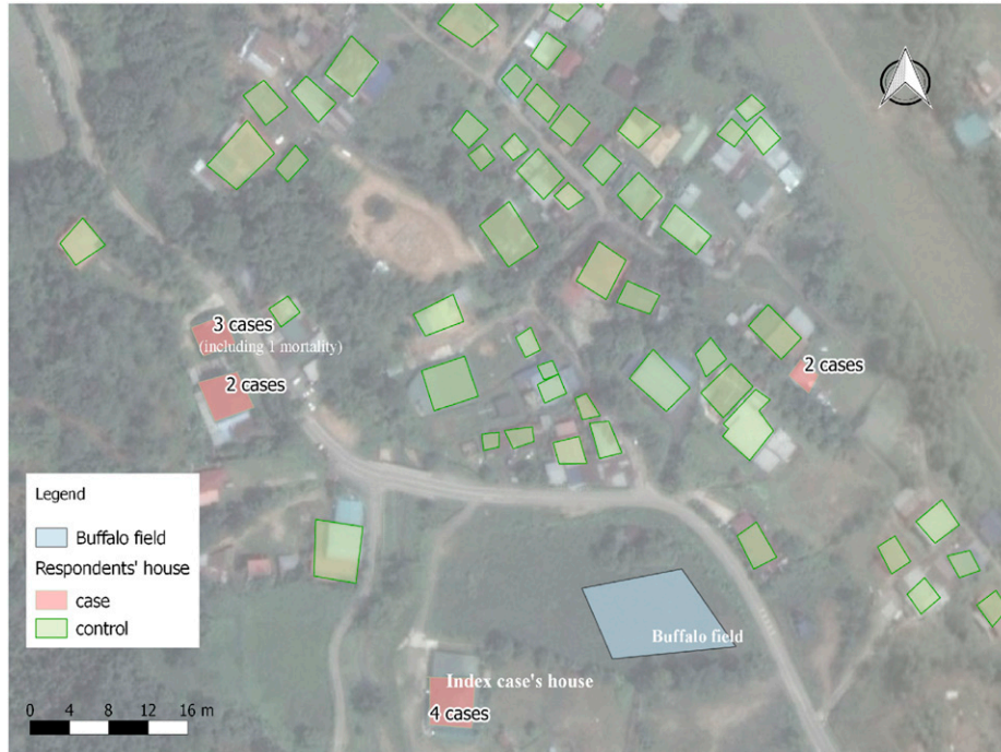
FIGURE 1. The location of the respondents' houses during the case-control study and the buffalo field which is one of the breeding sites for vector mosquitoes. This figure appears in color at www.ajtmh.org .

with crude OR = 5.2 [95% CI: 1.2; 22.3] and employment as rubber tappers with crude OR = 4.7 [95% CI: 1.2; 18.8]. However, after adjusting with other variables, only one factor was significant, that is, living nearby stagnant water with adjusted OR = 7.3 [95% CI: 1.2; 43.5] (Table 2).