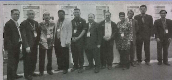
The UMS contingent with their prizes.