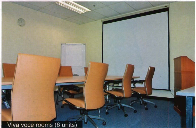
Viva voce rooms (6 units)