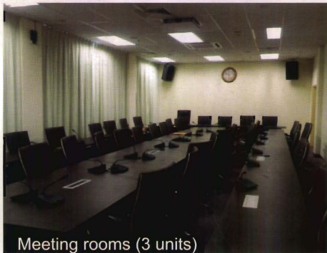
Meeting rooms (3 units)