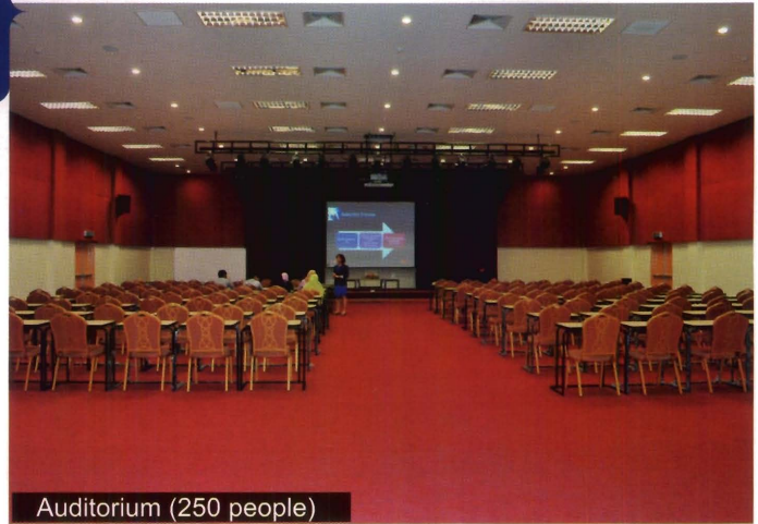
Auditorium (250 people)