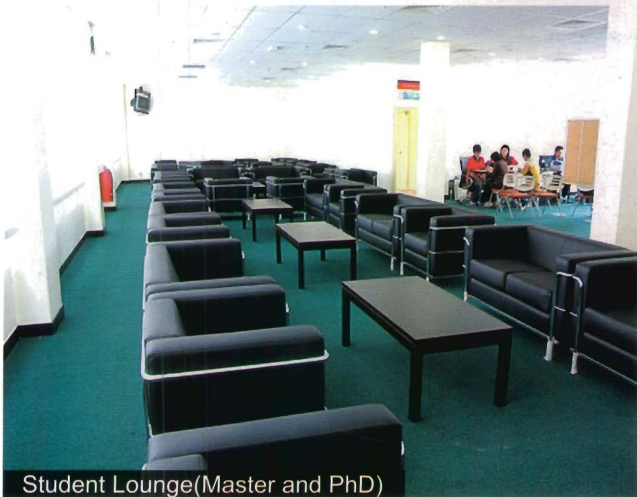
Student Lounge (Master and PhD)