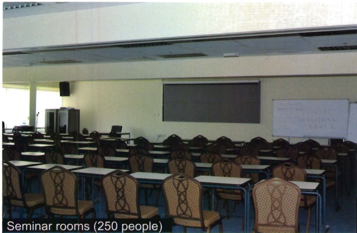
Seminar rooms (250 people)