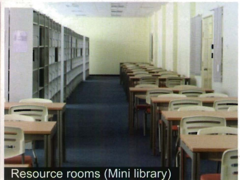
Resource rooms (Mini library)