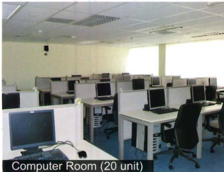
Computer Room (20 unit)