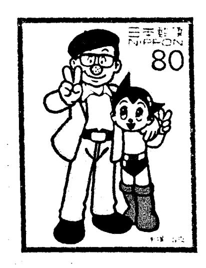
Figure 2.1 Japanese postage stamp memorialising Osamy Tezuka and Mighty Atom<sup>1</sup>

emotion in anime character's eyes is shown in the form of tingling, scintillating sparkles in anime. Japanese's faces are flatter than Westerners and their noses are less prominent. Consequently, artists were capable to draw faces from the front, just with simple line and color. Anime colors are applied in blocks and there are no shadows in anime. The elements of anime will penetrate deeply into "Secret Base" and hence we will focus more on our characters' eyes and face features. Unnecessary shadows will be avoided as well.