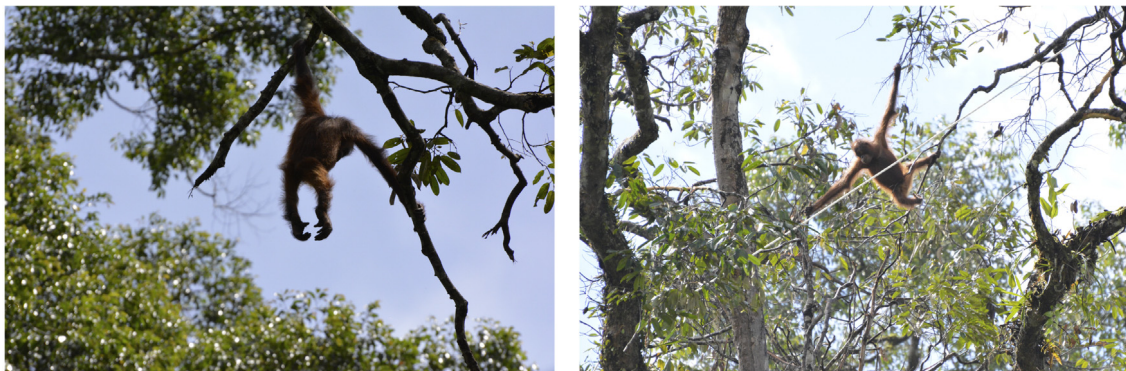
Fig. 3. Older juvenile female in the lowest branch of the tree looking down (left). Older juvenile female approaching the rope after being installed (right).

Female orangutans are philopatric and establish home ranges that overlap or are proximate to their mothers' (Goossens et al., 2006; Nietlisbach et al., 2012; van Noordwijk et al., 2012). Releasing the orangutan at the point of rescue increases