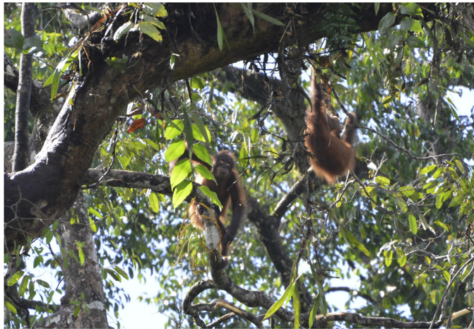
Fig. 2. The two juvenile females in close proximity before the rope being installed.