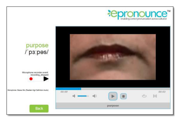
Figure 3 Text + Sound + Phonetic Symbols + Mouth Movements (TSPM)