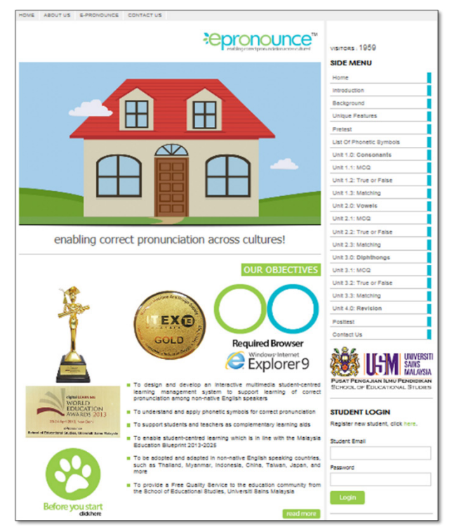
Figure 1 The home page of 'epronounce'

The 'epronounce' in this study is an interactive multimedia pronunciation learning management system, specially designed and developed for non-native English speakers to improve their pronunciation accuracy. The 'epronounce' is a dynamic website with database management system and web applications. The data can be edited, customized and upgraded easily and unlimitedly according to the current needs without the demand of having expertise in programming. Learners will always have real-time up-to-date information. The home page of 'epronounce' is illustrated in Figure 1.