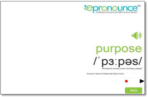
Figure 2 Text + Sound + Phonetic Symbols (TSP)

The issues of correct pronunciation have long been the concern in English language teaching and learning, especially in non-native English speaking countries. Therefore, this study investigated innovative solution to this problem with 'epronounce' by optimizing the capacity of phonetic symbols, mouth movements and face gestures without mere reliance on ear, as presented in Figure 2, 3 and 4. In order to demonstrate the articulation manner for correct pronunciation with phonetic symbols, the visual demonstration of mouth movements and face gestures enhances the learners' speech production by visually and verbally guiding the learners through the pronunciation learning process in supplementing the phonetic symbols. There are 83.3 per cent of the teachers in the preliminary survey agreed that observing visual demonstration, such as mouth movements and face gestures of human brains are activated in hearing when the learners follow the mouth movements or face gestures of a sound production (Calvert et al., 1997).