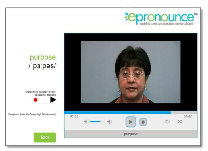
Figure 4 Text + Sound + Phonetic Symbols + Face Gestures (TSPF)

To design and develop the feasible and enticing 'epronounce', factors affecting pronunciation acquisition are studied to determine the effectiveness of the multimedia instructional design. In the study of Gömleksiz (2001), it is noted that non-native speakers encounter problems in the learning of new language owing to some contributory factors, for instance, the level of cognitive development, psychological profiles and cultural background. According to Baker (2008), individual differences influence learners to perceive and produce non-native language accurately. Factors affecting