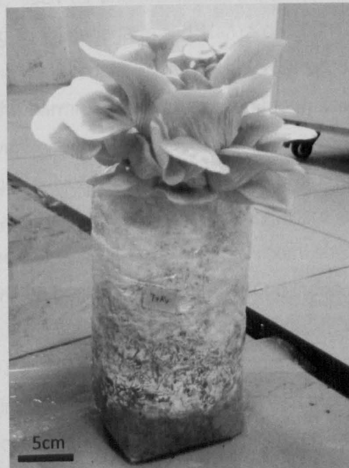
Figure 2.2 Pleurotus florida

modern mycologists are inclined to regard it as another species with different colour and different temperature requirements. According to Stamets and Chilton (1983), the flesh is normally thin and white (Figure 2.2). The margin is even and occasionally wavy. The gills are white, decurrently and broadly space. The stem is attached in an off-centred fashion and is short at first and absent in age. Its spores are whitish to lilac grey in mass.