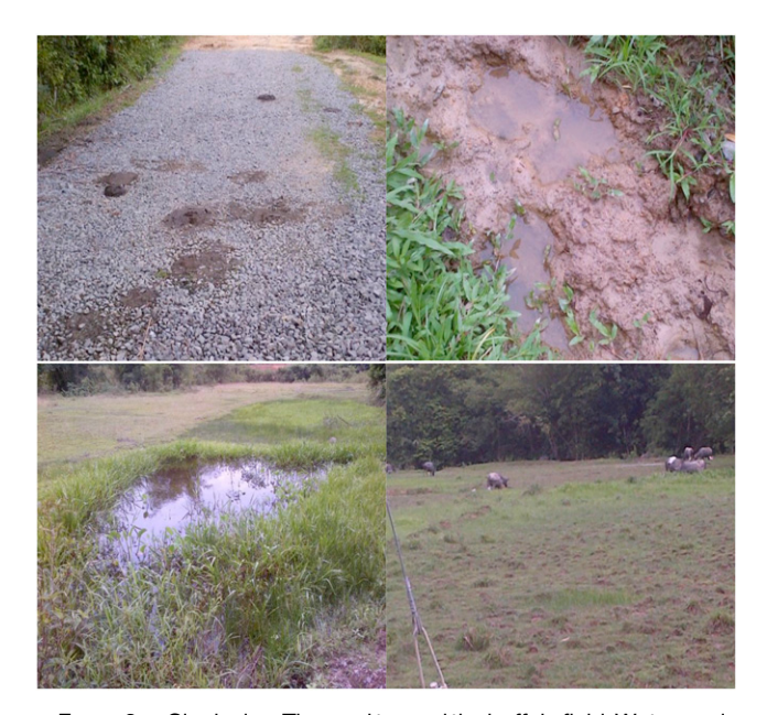
FIGURE 3. Clockwise: The road toward the buffalo field. Water pools in the buffalo field. A small pond situated in the buffalo field. The buffalos are grazing in the buffalo field. This figure appears in color at www.ajtmh.org.

peaked within a week, and the cases slowly peaked by June 25, 2012. The index case was possibly a migrant rubber tapper. The presence of P. falciparum gametocyte in his blood film for malaria parasite slide, the presence of the same parasite in all the cases, and the incubation period of 9-14 days of this Plasmodium along with his arrival 1 month back to this locality, all suggested introduction of the P. falciparum to the locality. In the interiors of Penampang, during the past 3 years, rubber cultivation had increased due to escalating rubber price and government initiatives. The impact was the influx of migrant workers, mostly undocumented immigrants from Indonesia. A large reservoir of infections would make the gametocytes available to the malaria vectors leading to stable and continuous transmission. In this outbreak, the high gametocytes prevalence rates indicated that the reservoir of malaria infections in the locality was higher. Under permissive climatic conditions, the infectious vector population could increase, leading to higher rates of malaria prevalence.<sup>7</sup>