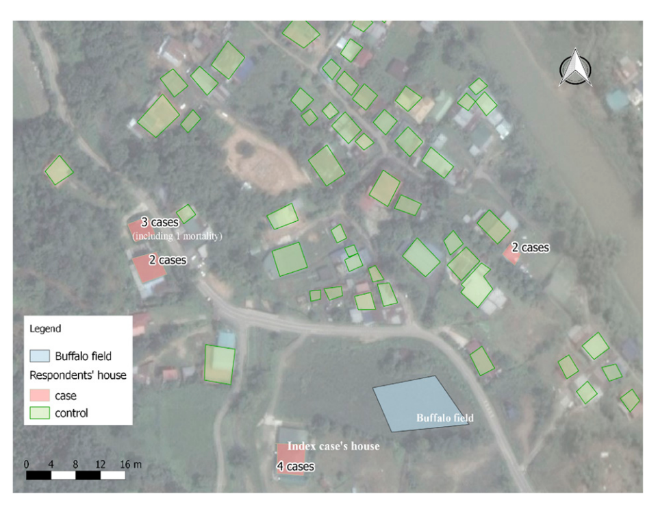
FIGURE 1. The location of the respondents' houses during the case—control study and the buffalo field which is one of the breeding sites for vector mosquitoes. This figure appears in color at www.ajtmh.org.

with crude OR = 5.2 [95% CI: 1.2; 22.3] and employment as rubber tappers with crude OR = 4.7 [95% CI: 1.2; 18.8]. However, after adjusting with other variables, only one factor was significant, that is, living nearby stagnant water with adjusted OR = 7.3 [95% CI: 1.2; 43.5] (Table 2).