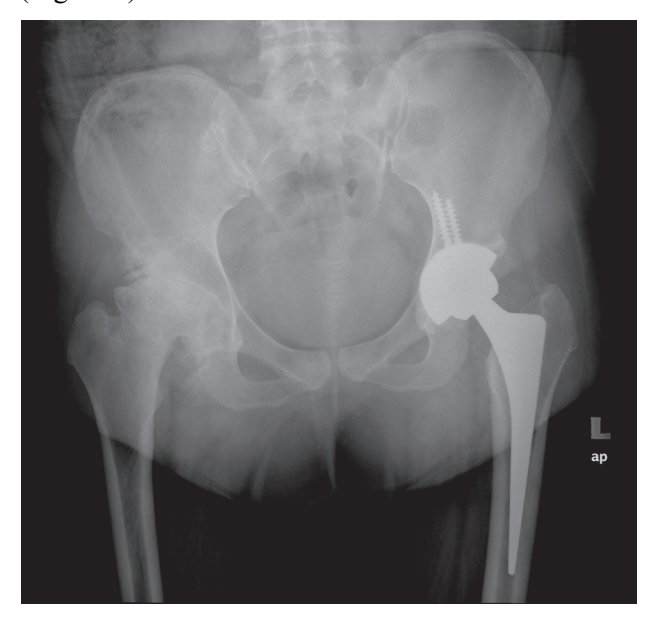
Figure 1: Anterior-posterior radiograph of pelvis showed right hip AVN with left THR in situ

On examination, she was an obese lady with a body mass index of 42. She had an antalgic gait. There was no shortening of the lower limb. Her right hip motion was flexion of 0-100, abduction-15, adduction 15, internal rotation 30 and external rotation 15. Telescoping test was negative. Radiograph of the pelvis showed AVN of right hip, Ficat stage IV with shallow acetabulum. There was left THR in situ (Figure 1).