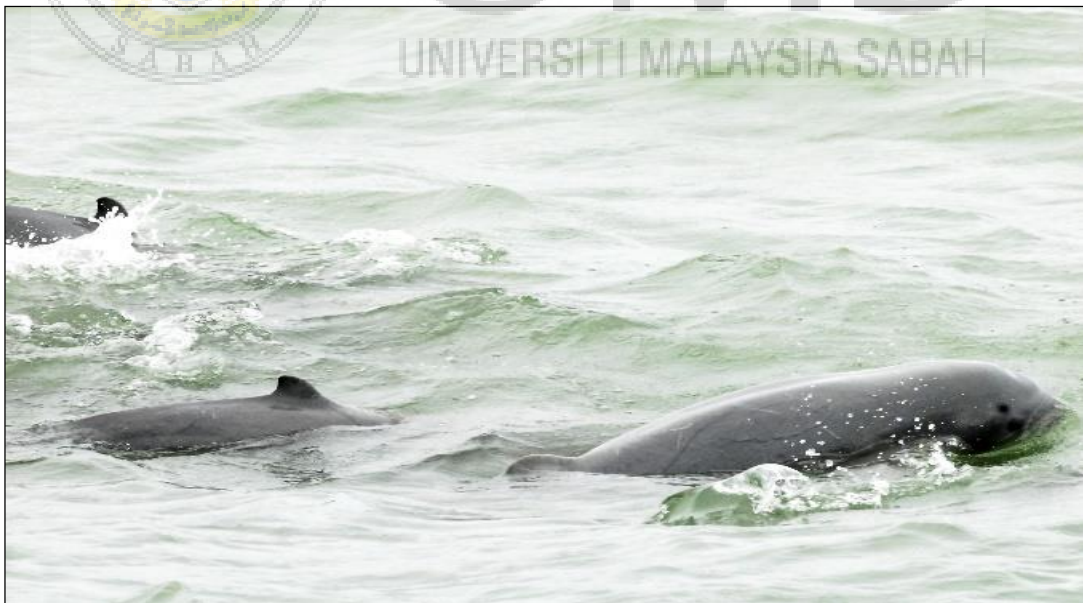
Figure 1.1: Irrawaddy dolphins of Rajang River.

The Irrawaddy dolphin is one of the six subspecies of river dolphins which remain extant today (Beasley, 2007). Leatherwood and Reeves (1994) stated that the Irrawaddy dolphins are described as facultative river dolphins due to their ecological flexibility that allows them to inhabit both marine and freshwater environment (Figure 1.1).